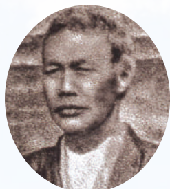
John Manjiro Nakahama