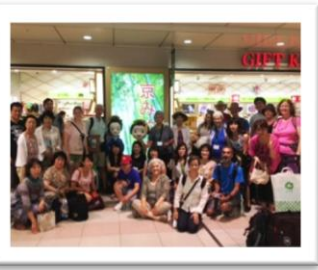
Kyoto & Tokyo Program - at Kyoto Station