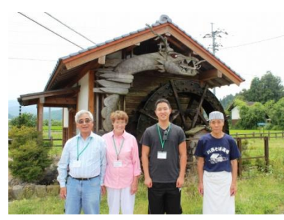
6. Okuizumo (3)