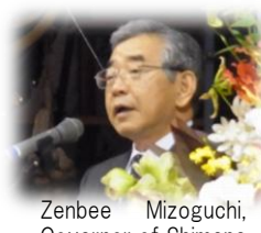
Zenbee Mizoguchi, Governor of Shimane