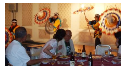
Dinner over umbrella dance