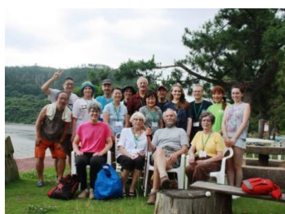
11. Oki Islands (13)