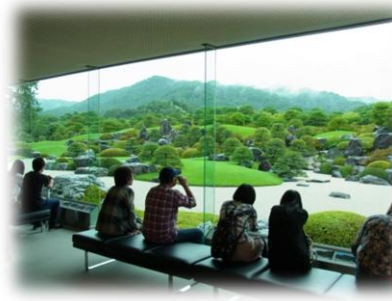
Adachi Museum of Art and Yasugi-bushi

The 3 different optional local tours were offered from 10 am. Each of them had unique taste and introduced the deep local cultures.