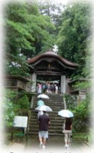
Deep in the Heart of Matsue