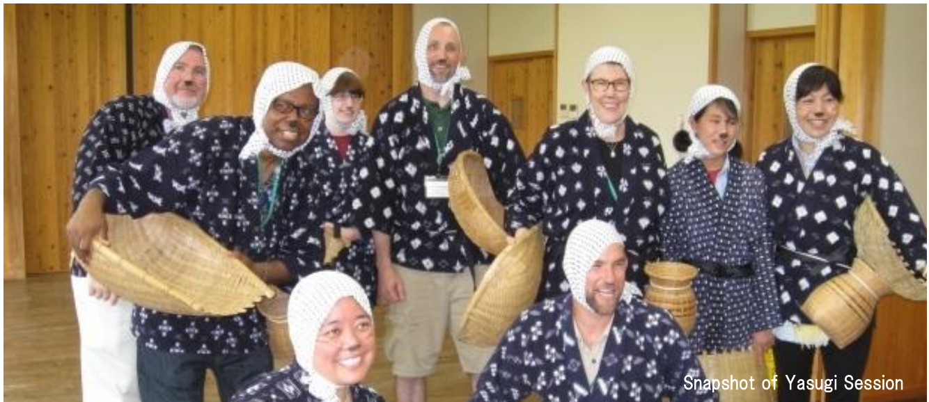
Snapshot of Yasugi Session

The 23 rd Grassroots Summit was held in Shimane, the hometown of Japanese mythologies, from July 1 to 8, 2013.