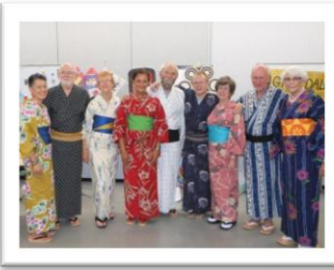
Sendai & Tokyo Program - at Sendai