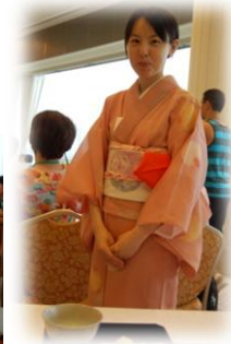
Volunteer wearing Kimono