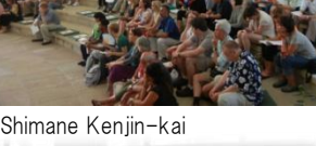
Scene of Ceremony