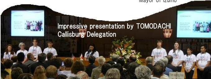
Impressive presentation by TOMODACHI Callisburg Delegation