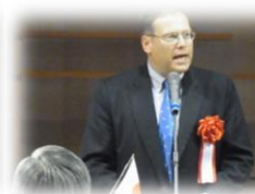
Kurt Tong, DCM of U.S. Embassy