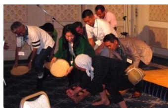
Lesson of dojo-fish catching dance