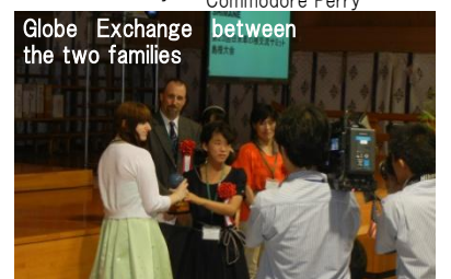
Globe Exchange between the two families