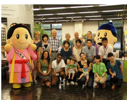
8,9. Gotsu & Hamada (6)