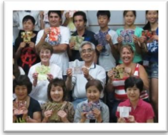
Hiroshima/Kochi & Tokyo Program - at Kochi