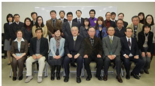
Shimane Summit Executive Committee Members