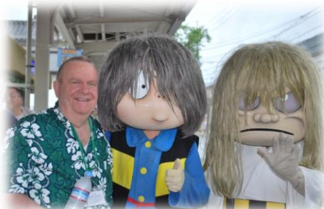
Yuushien & Kitaro Road