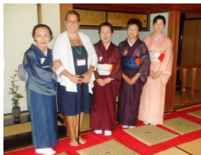
4. Izumo / Hirata (8)