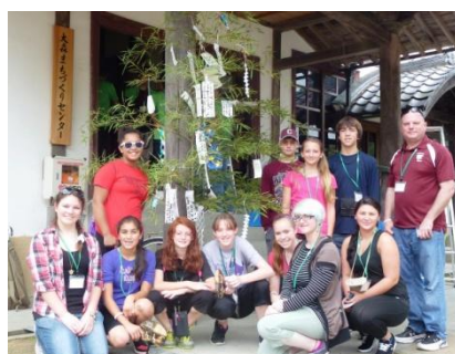
7. Ohda (15)