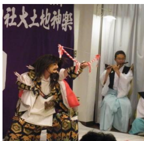
Performance of Shinto music and dance

The Welcome Reception was held at Shimane Winery, and the menu was BBQ of Shimane beef, sea food, and fresh vegetables.