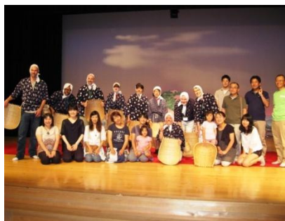
2. Yasugi (9)