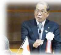
Hidetomo Nagaoka, Mayor of Izumo