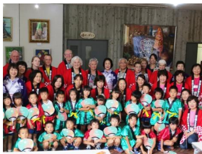
1. Matsue (9)

The numbers of American participants are listed in brackets