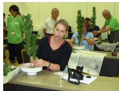
3. Izumo (8)